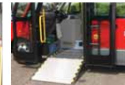
Rear doors with fold out ramp