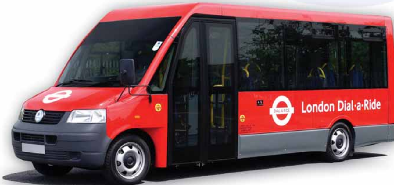
Flexible Seating Layouts