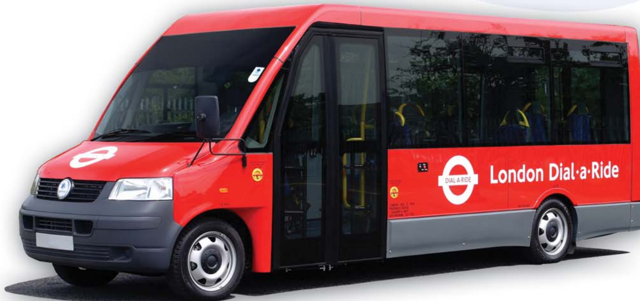
Flexible Seating Layouts