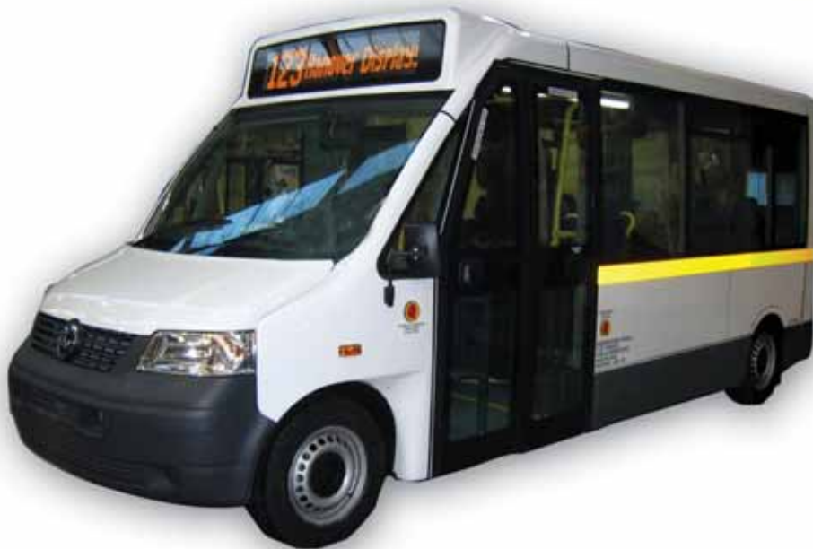
Flexible Seating Layouts